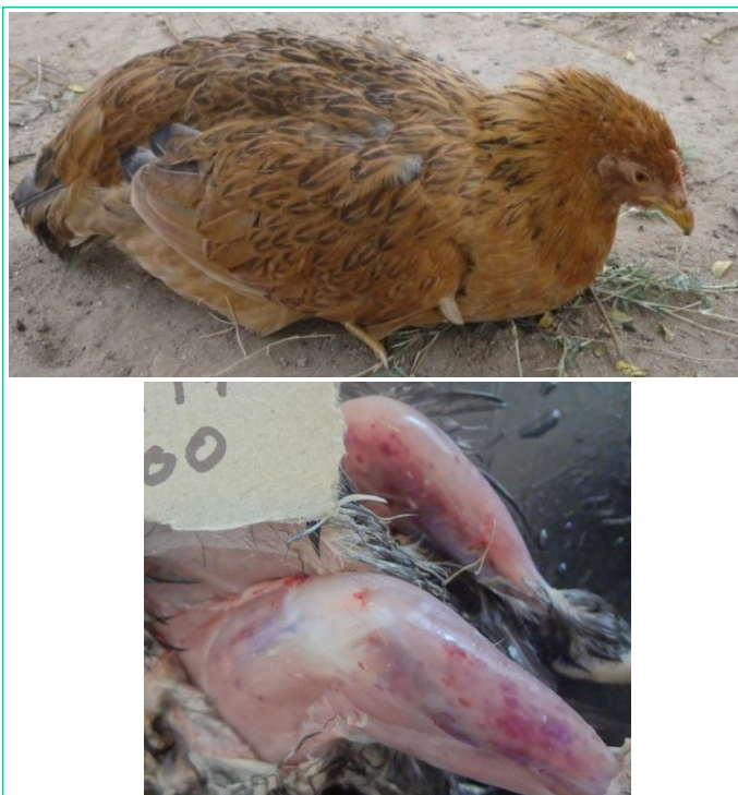
Figure 1: Ruffled feathers in a depressed and Haemorrhages on thigh and leg muscles of an indigenous chicken pullet suffering from infectious bursal disease [54].

The clinical signs of IBD vary considerably from one farm, region, country or even continent to another [79]. In acute form, birds are prostrated, debilitated, dehydrated, with water diarrhea and swollen vents stained with faeces. In birds below three weeks, the disease is asymptomatic, but birds have bursal atrophy with fibrotic or cystic follicles and lymphocytopenia before six weeks and are usually susceptible to other infections that would be contained in immunocompetent birds (Figure 1) [54].