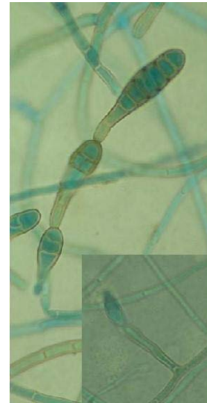
Figure 1C: Alternaria with Conidia arising in unbranched chains, golden brown, smooth-walled or slightly verrucose, generally with 4-7 transverse and one or two longitudinal septa.

Traumatic inoculation is the usual mode of cutaneous infections with Alternaria . Cutaneous lesions reported range from papules, plaques, verruciform, chronic vegetative forms to ulcers and eczematous lesions. Diagnosis requires biopsy and positive cultures [5,7-9]. Pigmented hyphae elements may sometimes be detected on melanin staining (Fontana - Masson) indicating a dematiaceous fungus [10]. Molecular analysis by sequencing the rDNA Internal Transcribed Spacers (ITS) domain has been used to help with pathogen identification [9]. The optimal antifungal agent and duration of therapy for alternariosis is not standardized and use of various agents including itraconazole, amphotericin B, voriconazole and posaconazole has been reported. A study to assess the in vitro susceptibility profile of clinical Alternaria isolates showed that amphotericin B had the lowest MICs in vitro against the 2 species of Alternaria [11]. Among the azoles, posaconazole had the lowest MICs more so to Alternaria infectoria (GM=0.66mg/L) than Alternaria alternata (GM=1.23 mg/L). Echinocandins had good activity to Alternaria alternata but not against Alternaria infectoria .