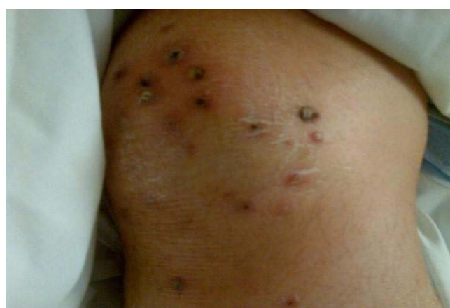
Figure 1A: Erythematous papules with central hemorrhagic crust over the knee.

epidermal hyperplasia with dermal acute inflammation. Fungal elements were identified on H & E section. GMS stain highlighted large round elements and rare toruloid septated hyphae (Figure 1B). The Fite and gram stains were negative for acid fast bacilli or bacteria respectively. Fontana-Masson special stain revealed pigmented fungal organisms as well which supported the diagnosis of a dematiaceous fungus. Culture from the biopsy grew mold on Sabaraud's Emmons dextrose agar in 7 days, identified as Alternaria (Figure 1C). The patient was treated with liposomal amphotericin B and posaconazole. He had a bronchoscopy with BAL that was negative for fungi. His cutaneous lesions slowly improved over the ensuing weeks but due to significant respiratory complications from underlying disease he has had a prolonged course in the intensive care unit. He presently remains ventilator dependent but continues to slowly recover from his multisystem organ failure and is no longer neutropenic. His APL is in remission.