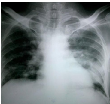
Figure 2: Second chest radiograph showing bilateral multiple abscesses.