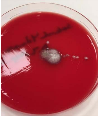
Figure 2: Aspergillus spp grew on blood culture of deep tracheal aspirate specimen.