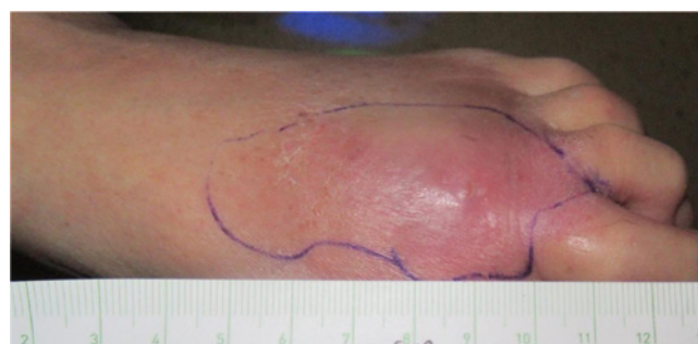
Figure 1: The patient presented with left foot swelling and erythema for 3 months.

He was admitted and underwent magnetic resonance imaging