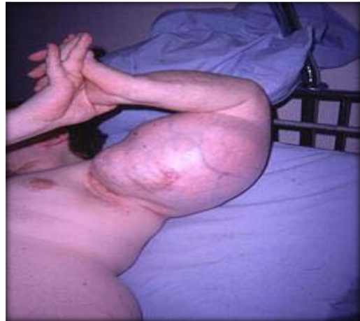
Figure 1: Clinical findings.

In 1998, a 30 year old male patient was presented with a dominant tumorous mass of the proximal left humerus (Figure 1). He had been operated few ways, last operation was performed for 10 years previously because he had multiple exostosis since childhood. The patient has had not completed documentation for previously operations, only for last operation. That operation has been done on both forearms because there was exostosis. After that patient has had fractures of both forearms. Physical exam showed no abnormalities except a tumorous mass of proximal left humerus sized approximately 30 cm, reduced length of both forearms and exostosis on both proximal lower legs. Patient has had two times a transient peripheral paralysis