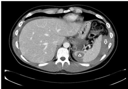
Figure 2: The emergency abdominal CT-scan revealing a massive hemoperitoneum (white arrow) due to sudden rupture of spleen abscess (white triangle).

valve replacement, during his rehabilitative course, he complained of sudden dull pain on his left upper abdomen and suddenly fell into shock. An emergency abdominal Computed Tomography-scan revealed a massive hemoperitoneum and suspicion of rupture of spleen abscess (Figure 2).