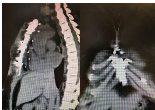
Figure 5: Sagittal and Coronal sternal Computer Tomography following complete healing.