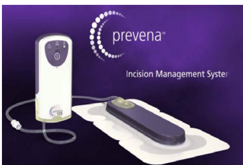
Figure 2: Prevena™ wound management system.