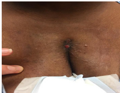
Figure 4: Sternal wound healed after prolonged treatment with V.A.C™ system and antibiotics.