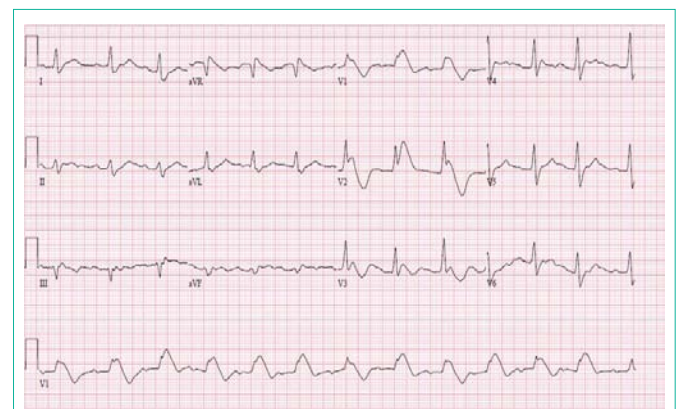
Figure 1: ECG on admission.

ECG's showed complete resolution after 30 hours of observation (Figure 2). No rhythm disturbances were observed. The flecainide