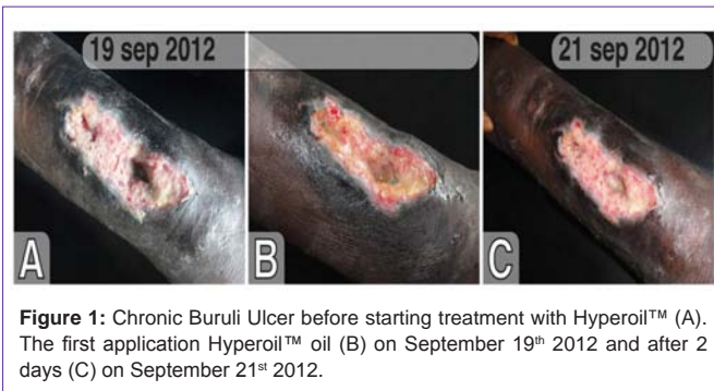
Figure 1: Chronic Buruli Ulcer before starting treatment with Hyperoil™ (A). The first application Hyperoil™ oil (B) on September 19 th 2012 and after 2 days (C) on September 21 st 2012.

being scarcely elastic and edematous in the area around the lesion.