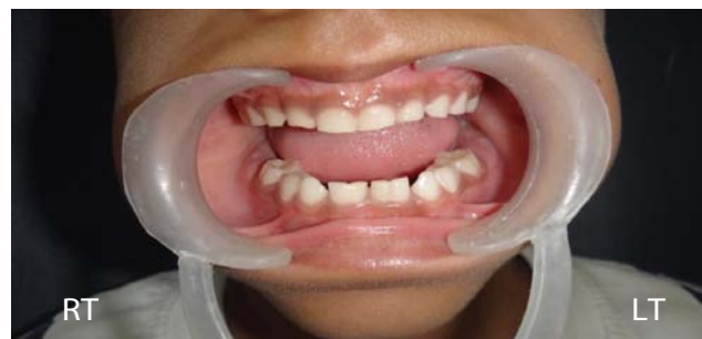
Figure A: Intra oral photograph of the patient showing fused 71, 72 and 81, 82.

An Intra Oral Periapical Radiograph (IOPA) was advised. Radiographic evaluation of the IOPA revealed fused 71-72; and 81-82 with two crowns and two roots fused together and two separate root canals, one in each of the fused teeth indicating that the fusion was of incomplete type. Absence of a single incisor was also observed on the radiograph (Figure B). To confirm the findings and to detect any other abnormality an Orthopantomograph (OPG) was advised. The