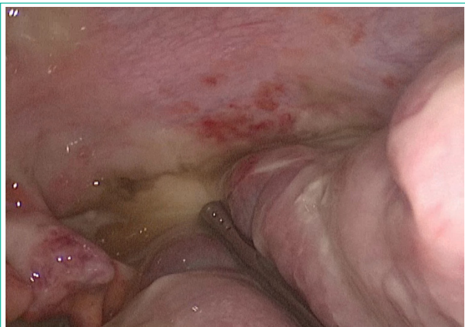
Figure 4: Pelvic cavity.

During the operation the abdominal cavity was diffusely covered with purulent contents, the consistency of the fundoplication site, integrity of the stomach, small and large intestine walls was assessed - no defects were revealed (Figure 3, Figure 4). During the intervention, 100 ml of methylene blue solution was administered through a nasogastric tube. When assessing the anastomosis integrity, no extravasation was detected, the integrity of the anastomosis was preserved. Purulent film was taken for bacterial culture. Sanation of the abdominal cavity was performed. Drainage of the right and left lateral canal, subhepatic space and small pelvis was performed. Antibacterial therapy was started for the patient in the postoperative period - meropenem 1.0 x3 i/v, metronidazole 5%-100.0 i/v, massive infusion therapy at the rate of 30 ml/kg/day, parenteral nutritional support was