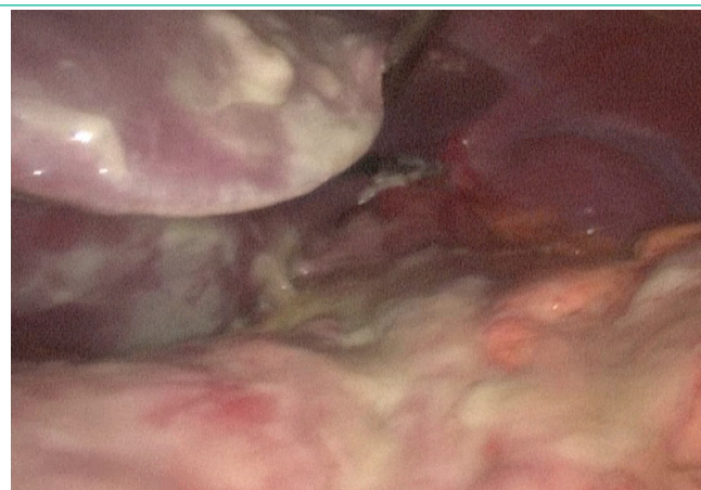
Figure 1: Subhepatic area.

Direct bilirubin - 0.4, Albumin - 2.8, Amilaza - 39, Kreatinn - 0.9. The patient underwent computer tomography of abdominal cavity organs and diffuse peritonitis was confirmed. The patient underwent diagnostic laparoscopy (Figure 1, Figure 2). At revi-