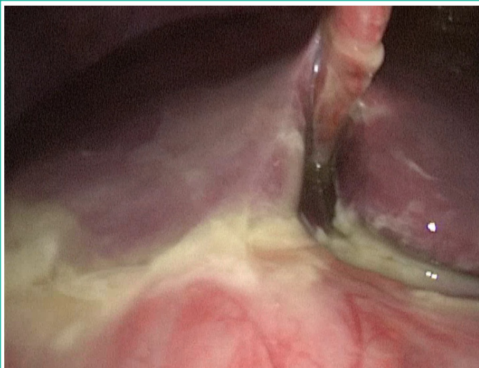
Figure 2: Purulent diffuse peritonitis.