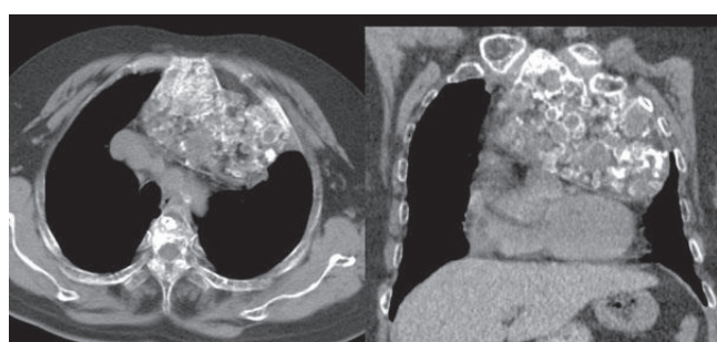
Figure 1: Chest axial and oblique reformatted CT images showed giant sternal mass with scattered circular or arc calcifications.

A 62-year-old woman presenting with exertional shortness of breath for 18 months was admitted to our hospital. Chest CT showed Sternal tumor with circular calcification, shifting adjacent mediastinal structures (Figure1). Diagnostic biopsy of the lesion was indicative of