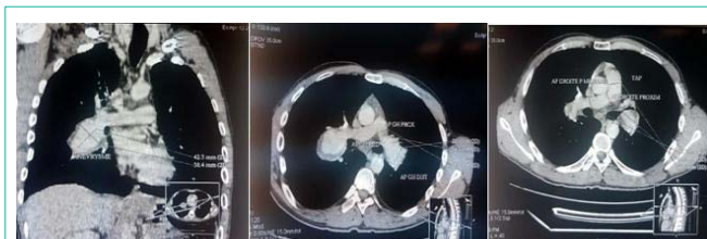
Figure 1: Contrast-enhanced CT scans of his chest demonstrated a bilateral pulmonary artery aneurysm.

A young Moroccan military male of 35 years old with medical history of pulmonary tuberculosis treated 03 years ago has been admitted to our department for an isolated mild hemoptysis. He had a one year history of recurrent oral and genital ulceration. His physical examination was within normal limits). Contrast-enhanced CT scans of his chest demonstrated a bilateral pulmonary artery aneurysm (Figure 1). To asses extension of the disease a transthoracic echocardiography showed a mobile right ventricular mass (Figure 2). A cardiac MRI was subsequently done, which showed a 3.8 cm 1.6 cm right ventricular mass attached to his inter-ventricular septum (Figure 3). An ophthalmologic examination of our patient showed no