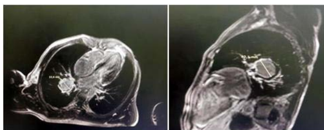
Figure 3: Cardiac MRI showed a right ventricular mass attached to his interventricular septum.

40 years old, whom usually present with hemoptoic cough, dyspnea, chest pain and signs of pulmonary hypertension following history of deep venous thrombosis [1]. The cardiac thrombus mainly in the right ventricle keeps to be an exception in HSS [1,11].