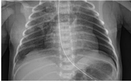
Figure 3: Plain radiograph of the chest, showing the Spinnaker-Sail Sign.

usually enough to diagnosis pneumomediastinum, it may show a halo around the heart border or air elevating the thymus and giving rise to a crescentic configuration and a wind blown spinnaker sail as in our patient [7,8].