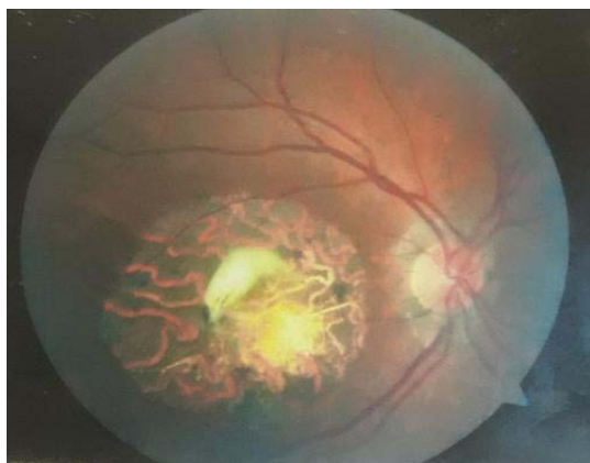
Figure 1: Color fundus photography showing a rounded macular lesion with a yellowish background and abnormal visibility of choroidal vessels with peripapillary atrophy.

Figure 1 having Color fundus photography showing a discolored rounded lesion of the macula with a yellowish background, with abnormal visibility of choroidal vessels and peripapillary atrophy. Figure 2 having Retinal fluorescein angiography showing an inhomogeneous macular lesion with gradual staining by window effect, corresponding to a macular atrophy with retinal pigment