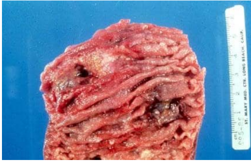
Figure 1: Macroscopic view of CMV Colitis showing mucosal ulceration (with permission-Cho et al. [11]).