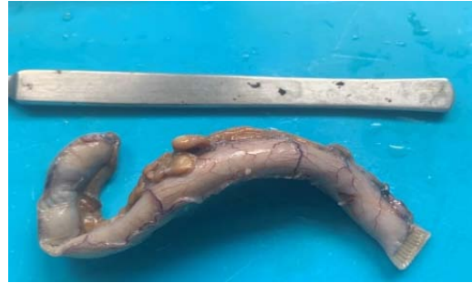
Figure 3: CMV appendicitis specimen.

Pathology occurring in HIV/AIDS patients may be classified into (a) diseases with a definitive association with HIV and (b) coincidental diseases seen in the general population especially as HIV/AIDS patients on HAART are living longer. The commonest presentation in AIDS requiring laparotomy is toxic megacolon, small bowel obstruction and localized peritonitis [1,9]. The commonest disease processes, CMV colitis, B-cell lymphoma, acute appendicitis with CMV infection and atypical Mycobacterium Avium Intracellulare (MAI) infection are quite different from that seen in the non- HIV population [1,9,10]. The case demonstrates a good clinical outcome following early intervention on an HIV/AIDS patient with most probable toxic CMV colitis and appendicitis.