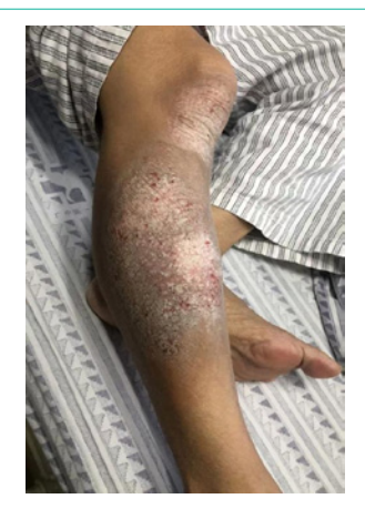
Figure 1A: Dark red maculopapular rash on the extended side of right lower leg, covered with thick layer of white scales, with the lesion extending to the knee and lower 1/3 of the lower leg.

Laboratory and auxiliary examinations: routine blood, urine and feces, coagulation function, blood biochemistry and serum protein electrophoresis showed no obvious abnormalities. Chest CT plain scan considered bronchiectasis of both lungs, and the combined infection was better than the previous absorption. Histopathological examination of skin lesions: incomplete keratinization of epidermis, neutrophil infiltration in local areas, thinning of granular layer,