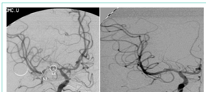
Figure 1B: Right MCA before and after angioplasty and stenting.