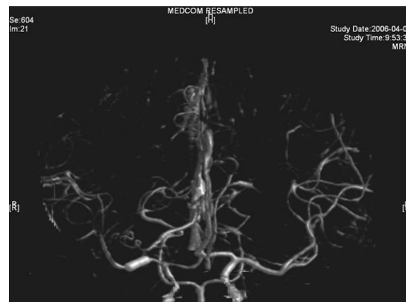
Figure 1D: CTA image.

She was discharged from hospital on Apr 4, and continued oral aspirin (100mg/day) and clopidogrel (75mg/day), no symptoms occurred again. TCD test on Apr 17 showed the blood flow velocity increased significantly in the right MCA, compared with that on Mar 23, the blood flow velocity in the right ICA also increased significantly but the blood flow velocity in both ACA returned to the levels before operation. TCD on May 22 showed no significant change compared with that on Apr 17. She was followed till now with few TIA attacks on aspirin only for at least five years. Four repeated ESR and ASO tests revealed persisting abnormal values, which were similar to the previous levels. TCD follow-up was similar to that on May 22, 2006.