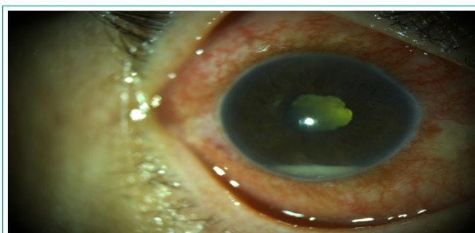
Figure 1: Upon admission.

Ophthalmological examination reveals a decrease in visual acuity with positive light perception with high tone in the finger, conjunctival hyperemia, a perikeratic circle, synechiae and hypopyon (Figure 1). An ocular ultrasound performed showing vitreous condensation. Venous treatment based on dual therapy and IVT. A worsening of the picture with the appearance of rubeosis iris and hyphema (Figure 2).