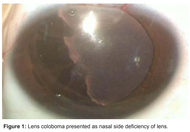
Figure 1: Lens coloboma presented as nasal side deficiency of lens.

fluid might gain access to the subretinal area through the break in ciliary body [1]. Apart from ocular defects, lens coloboma might be one of the manifestations in systemic diseases, including Marfan syndrome and Marshall syndrome [4-6]. Several case reports had shown the association between Marfan syndrome and lens coloboma, and it is postulated that increased Transforming Growth Factor \beta (TGF \beta ) might be the link behind [5]. In our case, the patient had lens coloboma without accompanying congenital cataract, and no other systemic diseases were noted.