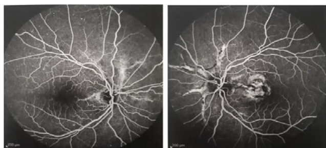
Figure 1 and 2: Inhomogeneous hyperfluorescence from the early times in both of eyes in posterior pole persistent in time.

In fluorescein angiography, an inhomogeneous hyperfluorescence was objectified from the early times on two eyes concerning the posterior pole persistent in time (Figure 1 and 2), with on the left eye hyperfluorescence taking all the persistent macular area in late times : This is a juxta-foveolar choroidal neovascularization confirmed with