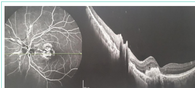
Figure 4: Hyperfluorescence taking up all the persistent macular area at late times complicated by juxta-foveolar choroidal neovascularization confirmed by optical coherence tomography.

optical coherence tomography (Figure 3 and 4).