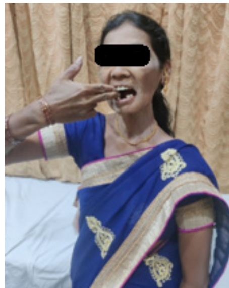
Figure 5: Showing increased Maximum Mouth Opening.

Follow Up and Outcome: follow up and outcome measure comparison are mention in the table 5 (Figure 1 and Figure 5).