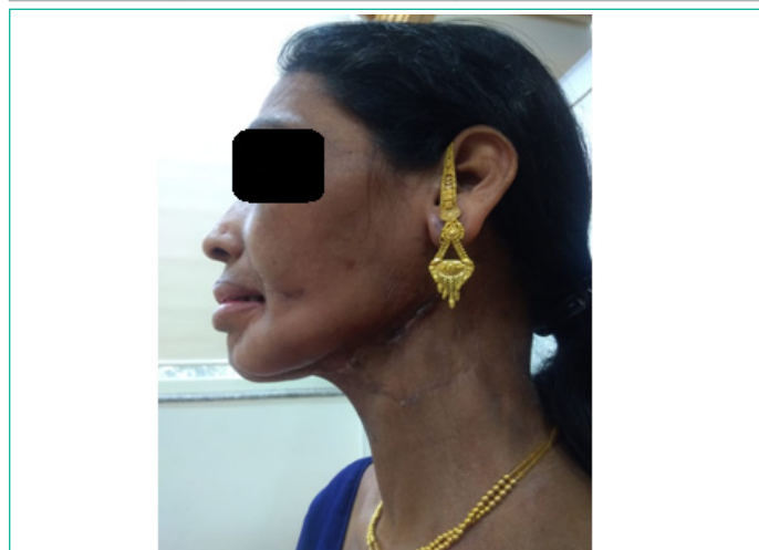
Figure 1: Showing Site of Surgery of patient.