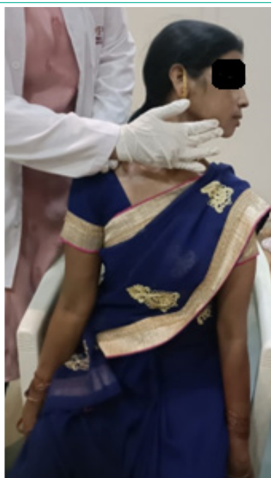
Figure 4: Stretching exercise of SCM Muscle.