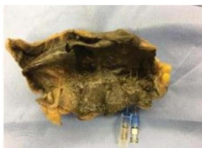
Figure 3: Intestinal necrosis with gangrenous changes.