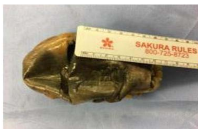
Figure 4: Intestinal necrosis with gangrenous changes.

to be relatively benign. The patient in our facility was treated with SPS which removes potassium by exchanging sodium ions for potassium ions in the intestine. This cation exchange resin is usually mixed with sorbitol, a cathartic, to avoid constipation and fecal impaction, but hypertonic sorbitol may directly damage intestinal mucosa. With this recognition, in September 2009, the US Food and Drug Administration (FDA) added a new warning of this drug. Specifically, it stated that, “Cases of colonic necrosis and other serious gastrointestinal adverse events (bleeding, ischemic colitis, perforation) have been reported in association with Kayexalate use”. Most of the cases reviewed in the FDA warning reported the “concomitant use of sorbitol” and because of this “concomitant administration of sorbitol is not recommended.” In fact, it is considered a Risk X and combination should be avoided [2]. Despite this warning, in many hospitals the premixed sorbitol-SPS preparation is the only SPS product available, with an estimated