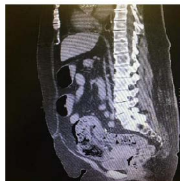
Figure 1: CT abdomen, sagittal view. Distention of the recto-sigmoid colon.

Our unique case highlights two rare events that must be included in the differential diagnoses when simple, more common answers do not explain the clinical picture. While rare, both events – hyperkalemia caused by heparin and intestinal ischemia caused by SPS – occur in the context of routinely utilized medications which are otherwise thought