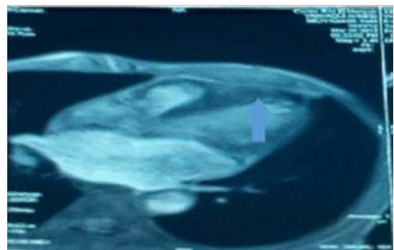
Figure 1: Cardiac MRI showing a nodular myocardial contrast taken antero-septally and linearly under the pericardium at the tip of the left ventricle.

An etiologic assessment of this eosinophilic myopericarditis was initiated. Thoracic CT scan showed a diffuse thickening of the bronchial fibroscopy walls and a multifocal subpleural frosted worm appearance. Functional respiratory explorations showed a minor obstructive profile. Bronchial fibroscopy showed an inflamebronchial mucosa. Bronchoalveolar lavage fluid cytology showed moderate eosinophilic polynucleosis with a Gold score of 850.Histological study of bronchial biopsy concluded to the presence of tissue eosinophilia. Nasal biopsy showed an aspect of chronic rhinitis without eosinophilic infiltration. Myelogram showed eosinophilic infiltration at 50%. Electromyogram was without abnormalities. Brain MRI