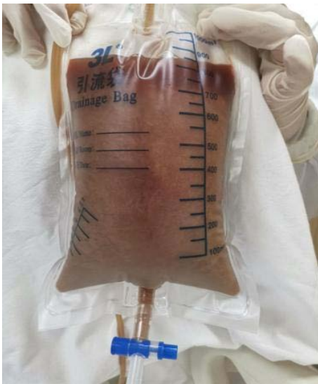
Figure 2: The ascites was anchovy-sauce-like fluid which indicated the possibility of amebic liver abscess.

To further clarify the diagnosis, on day 3 after admission, a liver Contrast Enhanced Ultrasonography (CEUS), which performed before and after the administration of Sulphur Hexafluoride Microbubbles (SonoVue) with grayscale scanning technique in real time, revealed a giant mixed echo mass (13.5*12.3 cm) in the right hepatic lobe. The mass boundary is not clear and irregular morphology. After SonoVue contrast administration, there is no enhancement in the peripheral and internal area of the mass (Figure 3, Video 1). Puncture and drainage were performed successively under the right phrenic (a total of 1790ml odorless anchovy-sauce-like fluid) and crypt effusion of liver. Routine bacteriological culture and metagenomic Next-Generation Sequencing (mNGS) were inspected, all of which were also negative. On the fifth day after admission, the huge liver abscess was punctured under the guidance of bedside ultrasound, and the punctured fluid was also like “anchovy sauce” (a total of 2620ml). The abscess in the center and around the