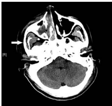
Figure 2: Plain computed tomography images of the head showing bilateral maxillary sinusitis with plugging of the right maxillary sinusitis (white arrow) and nasal cavity. Extensive sphenoid and ethmoid sinusitis was also present (not shown). No evidence of bony erosion or intracranial hemorrhage or infarction was seen.