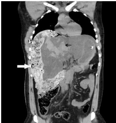
Figure 1: Reformatted coronal image of computed tomography images at admission after control of hemostasis showing surgical packs (white arrow) placed for control of hemorrhage from liver lacerations and hemorrhage (black arrow) resulting in hemoperitoneum. Control of hemorrhage required further administration of factor VIIa, angioembolisation and repeat laparotomy at 48 hours.