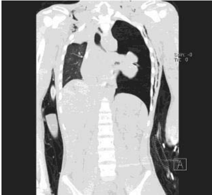
Figure 1: Chest CT showed left tension pneumothorax, a suggestion of a rupture of the left main bronchus can be seen.