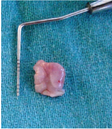
Figure 2: Excised gingival overgrowth.

lesions however, have been confused in the past to clinically similar enlargements seen in non-pregnant females as well as males [6]. These lesions have been coined by the term pyogenic granulomas.