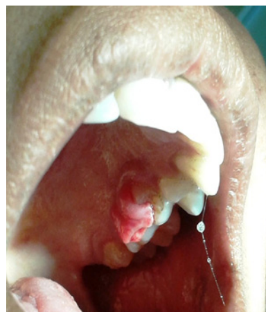
Figure 1: Preoperative view.

These lesions show a predilection for the interdental papillae region, maxillary anterior region being affected the most [5]. These