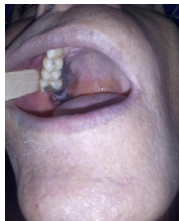
Figure 1: 56-year old man with large mucosal pigmentation, extending from the right maxillary canine to the tuberosity.

Amalgam tattoo may be a cause for biopsy when confused with melanosis (especially when there is no radiopacity) or when they are