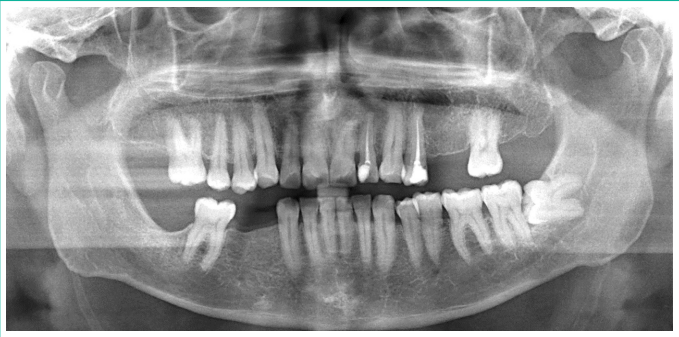
Figure 2a: Wrong estimation of panoramic radiograph of patient B. (bilateral normal condyles) They look like divided into two parts of more or less equal size by a deep groove.