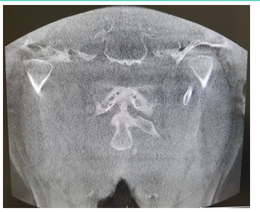
Figure 2b: CBCT coronal image of bilateral normal condyles of patient B.

& 2b) was 48.6%. There was no statistically significant difference between localization, type of BMC, type of groove, BMC depth and horizontal angle of BMC values according to whether the estimations were correct or incorrect (p>0,050) (Table 1 & 2).