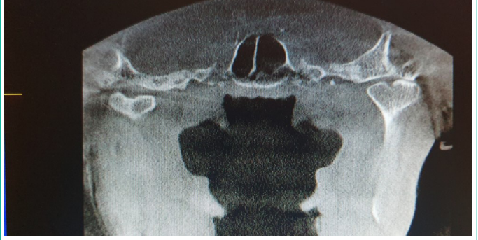
Figure 1b: CBCT coronal image of bilateral BMC of patient A.