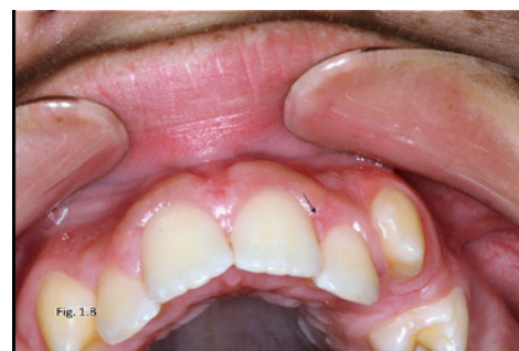
Figure 1B: A small scar had resulted from the excisional biopsy.