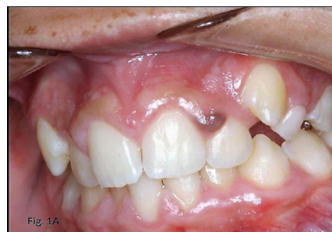
Figure 1A: Clinical pictures: a brown rounded papule (seemingly harmless) is shown on the gingival papilla. Multiple ephelis spots can be seen scattered on skin area of the lip.

the cases) in Caucasian individuals aging 40 years old or older [4,5]. Lesions are small, usually measuring less than 1 cm in diameter, ranging from brown to deep black in color. Melanotic lesions are harmless – excisional biopsy is only indicated as to differentiate it from melanoma and (most frequently) for cosmetic reason. Histopathology shows normal number and morphology of melanocytes and increase amount of melanin [1].