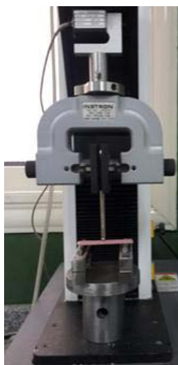
Figure 2: Instron testing machine.

to evaluate the effects of any additive or modifier on the mechanical properties of any acrylic materials to avoid all deleterious effect which may reduce their strength to below standard level [11,12].