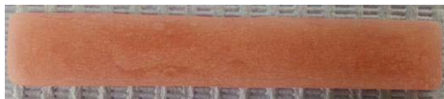
Figure 1: The prepared specimen for flexural properties testing.