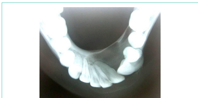
Figure 4: Lateral Mandibular Occlusal Radiograph: Revealed bicortical plate expansion from 33 to 42 and also shows scalloping between 32 and 33.