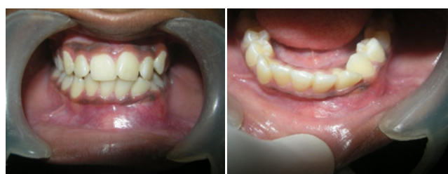
Figure 2a and 2b: Intraoral View: Showing a solitary oval shaped swelling was noticed on the labial vestibule which is extending from the distal aspect of 33 to the distal aspect of 41.

well-defined margins and no change in the surrounding mucosa. Obliteration of labial vestibule was seen. Also 34, 35, 36 and 37 were found to be lingually inclined and 34 and 35 have grade 1 mobility. On palpation, all the inspeactory findings were confirmed and the swelling was found to be non-tender and bony hard in consistency with area of soft fluctuancy. On electric pulp testing 33, 32, 31, 41, 42 shows early response. Based on the history and clinical examination, a provisional diagnosis of Central Giant Cell Granuloma was considered as it is more commonly seen in younger age group, and affects mandibular anterior region, crossing midline and Odontogenic Keratocyst was given as first differential Diagnosis.