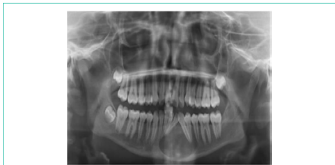
Figure 5: OPG: Revealed a solitary well defined oval shaped radiolucency with sclerotic border extending from 34 to 42 measuring 8cm X 3cm in size also shows displacement of root apex of 32 and 33.

Intra Oral Peri Apical Radiograph Figure 3 revealed a well-defined radiolucency extending from 34 to 42 with sclerotic border. Panoramic radiograph Figure 4 revealed a solitary well defined oval shaped radiolucency with sclerotic border extending from 34 to 42 measuring 8cm X 3cm in size also shows displacement of root apex of 32 and 33. Lateral Mandibular occlusal radiograph Figure 5 revealed bicortical plate expansion from 33 to 42 and also shows scalloping between 32 and 33. Root Canal treatment was done on the affected region's teeth i.e. 35, 34, 33,32,31,41 and 42 followed by cyst enucleation, and chemical cauterization using Carnoy's solution was done, the biopsy specimen was sent for histopathologic examination, which revealed corrugated surface with parakeratinization and palisaded basal layer suggestive of Odontogenic Keratocyst (Figure 6). Patient was kept on follow up and recalled after 1 month and panoramic radiograph Figure 7 revealed bone formation in the