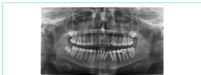
Figure 7: Postoperative View: Revealed bone formation in the previously affected region.