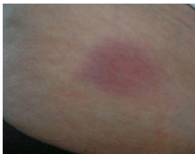
Figure 1: Violaceous round-oval sclerotic plaque over the right side of abdominal wall.

X-ray showed no pulmonary involvement; electrocardiographic record and echocardiogram were reported as normal; renal function