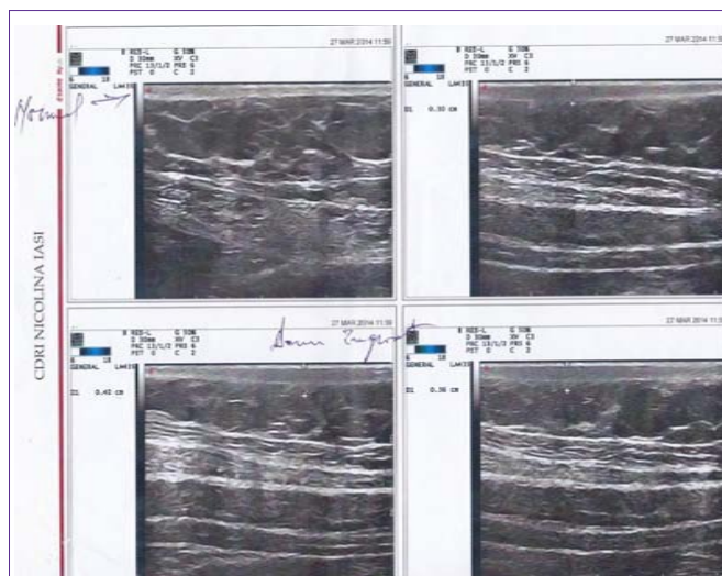
Figure 2: Cutaneous ultrasonography before narrow-band UVB; dermal thickness was 0.4cm in its highest point.

Cutaneous ultrasonography was performed and skin thickness was measured by using high-frequency US (18 MHz): dermal thickness was 0.4cm in its highest point (Figure 2).