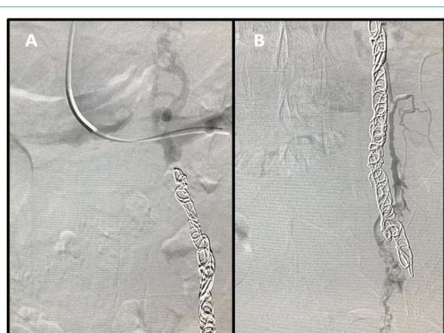
Figure 3: The embolization of the ovarian vein in this syndrome should be done almost to its full extent, starting distally (B) and extending to a plane more proximal to the point of initial contact with the ureter (A).

foam in the embolized vein and a fine accessory vein that ran parallel to it and connected with the pelvic varicocele (Figure 3).