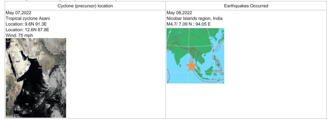
Table 1: Cyclone followed by earthquakes at the same epicenter zone.

Hurricanes are powerful storms that develop in a circular pattern over warm ocean water. Hurricane Irma which is one of the strongest