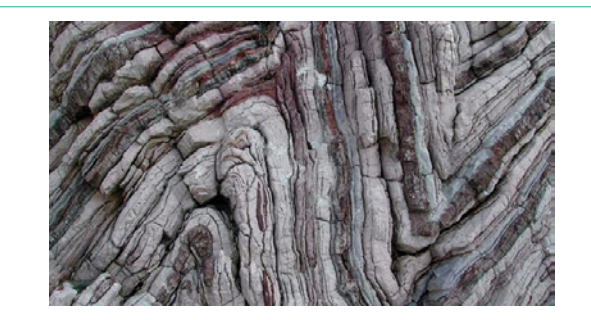
Figure 1: Tectonic Plates.