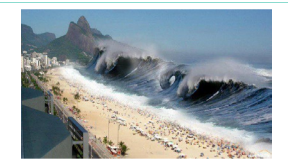
Figure 14: 2004, Tsunami.