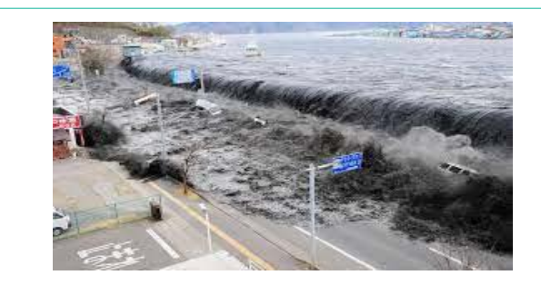
Figure 13: Earthquake.

The average economic damage from winter storms over the last 20 years has been about $1 billion a year.