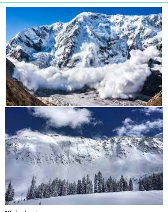
Figure 10: Avalanches.

fact that tornadoes and severe thunderstorms often form along drylines.