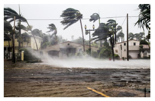
Figure 3: Cyclone.