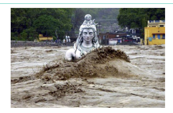
Figure 6: Uttarakhand Flood, India