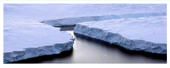
Figure 11: East Antarctic ice is melting.

The economic damage from this winter will be well above the average. That's because in January alone — before the big February snows that have dumped record levels of snow on Worcester - the U.S.'s economic damage from the winter weather of January 2015 was estimated at $500 million, according to Impact Forecasting.