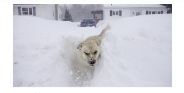
Figure 8: Snowfall.