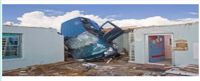
Figure 5: Damage caused by Tornadoes.

hurricanes on record produce winds of 185 mph. Each hurricane usually lasts for over a week, moving 10-20 miles per hour over the open ocean. Hurricanes tend to cause much more overall destruction than tornadoes because of their much larger size, longer duration and their greater variety of ways to damage property. Tornadoes and hurricanes may be similar in that they both have extreme winds