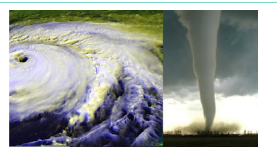
Figure 4: Hurricane and Tornado.

hurricanes on record produce winds of 185 mph. Each hurricane usually lasts for over a week, moving 10-20 miles per hour over the open ocean. Hurricanes tend to cause much more overall destruction than tornadoes because of their much larger size, longer duration and their greater variety of ways to damage property. Tornadoes and hurricanes may be similar in that they both have extreme winds