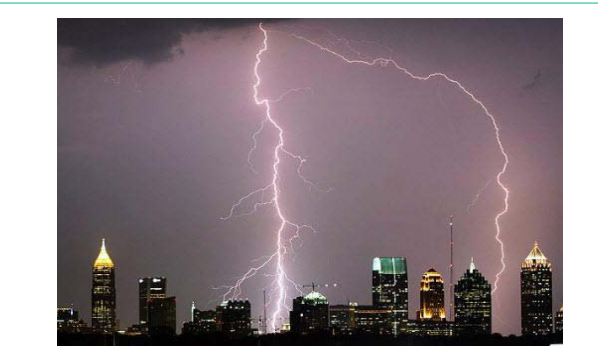
Figure 7: Lightening strike.

circulating around their centre that can cause damage.