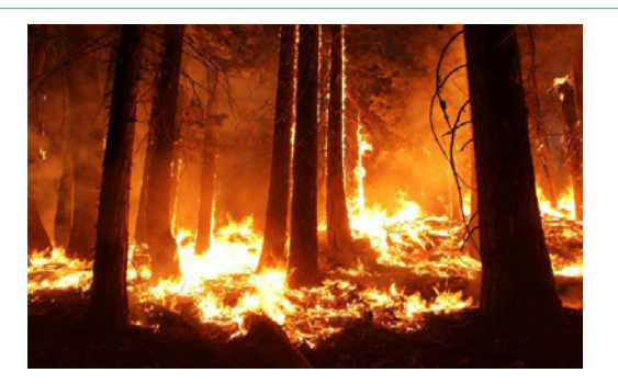
Figure 2: Forest Fire.