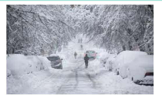
Figure 9: Snowstorm.