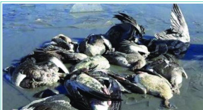
Figure 3: Bird mortality.

Water is an essential requirement for birds, comparable in importance to their need for sustenance. Similar to how we utilize water for diverse purposes, birds also have a multitude of uses for this vital resource. Apart from satisfying their thirst and rehydrating, water plays a crucial role in aiding birds with tasks such as preening, cleansing their feathers, and even eliminating parasites from their bodies.