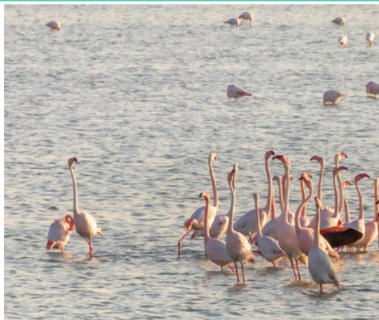
Figure 1: Evaporation Pond illustration.