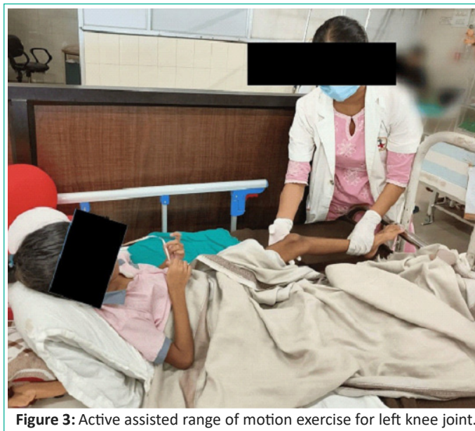
Figure 3: Active assisted range of motion exercise for left knee joint.