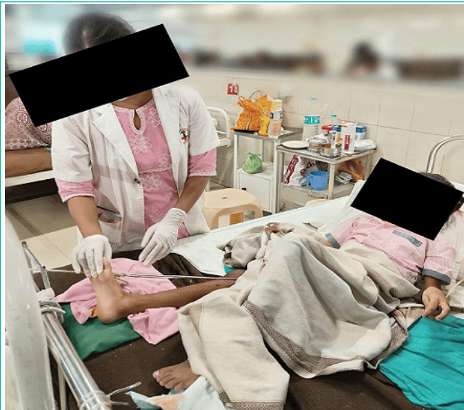
Figure 4: Demonstrates passive range of motion exercise for affected extremity.

Table 5: Shows range of motion of bilateral lower limb (pre and post rehabilitation) and Table 6: Shows manual muscle testing of bilateral lower limb (pre and post rehabilitation).