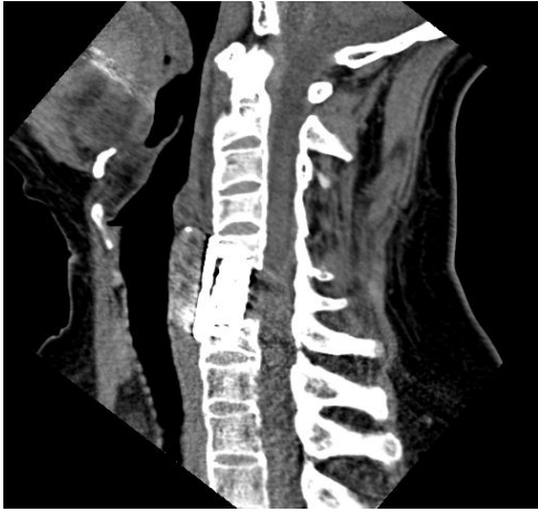
Figure 2: Internal instrument fixation over C5-7 with titanium mesh cage fusion.

identification of stable fractures is substantial in avoiding adverse neurologic outcome result from spine fracture [5]. Computed tomography (CT) may be the first choice with a shorter scanning time, and it can show bony details, including fractures and fragments. MR imaging can be much helpful in some patients with diagnostic limitation. 6 Prompt imaging studies of CT or MRI should be arranged to establish the diagnosis if needed.