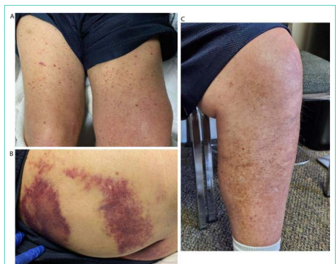
Figure 1: Physical Exam and Perifollicular Hemorrhage. A) Before treatment: Petechiae on thighs. B) Before treatment: Ecchymoses on buttocks. C) After two week's treatment: Lower extremities.

violaceous purpuric indurated patches over the bilateral upper and lower extremities, buttocks, and lower abdomen (Figure 1A and 1B). Corkscrew hairs were noted on the bilateral lower extremities (Figure 2A). The lower extremities were swollen bilaterally. There was no