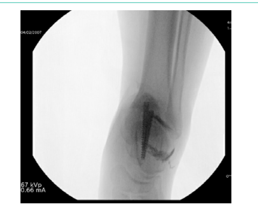
Figure 8: Imaging of calcaneus after injection of omnipaque into the subtalar joint with no visualization indicating communication with the screw.

concern of use of headless screw fixation is inadequate fixation in the setting of osteoporotic bone.6 In the pediatric population with a healthy child this is not typically an issue, and their bone quality is adequate.