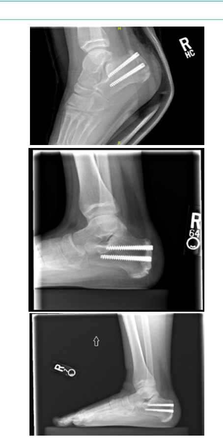
Figure 9: Two-week, Six-week and Six-month follow up lateral radiographs in consecutive order from left to right.

screw using the included driver and a sterile syringe (Figure 7). We also injected subtalar and did not see any expressed at the screw heads (Figure 8). The wound was thoroughly irrigated and closed with nylon suture. After sterile dressing we placed the patient in a posterior slab splint in 10 degrees of plantarflexion which was the position that the ankle naturally maintained while the ipsilateral knee flexed. The patient was gradually awakened from anesthesia and taken to PACU with no apparent complication and was discharged the same day with a plan to maintain non-weight bearing status and follow up in office.