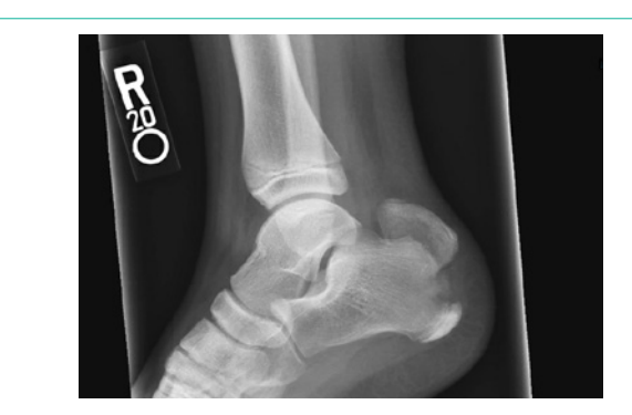
Figure 1: Lateral radiograph of right ankle/calcaneus demonstrating posterior calcaneal tuberosity avulsion fracture.