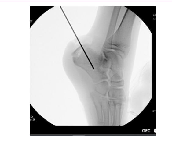
Figure 4: Fracture reduction with 2.0 K wire maintaining the reduction.