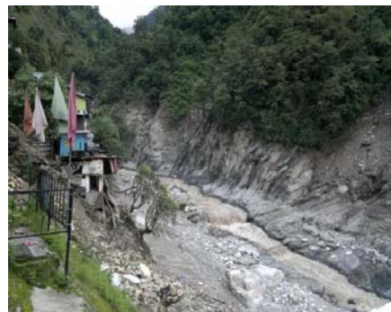
Figure 4: After 15 days level of water in Gaurikund.