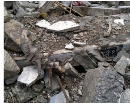
Figure 6: Skeletal remnants of humans and animals at Gaurikund, Uttarakhand, India.

Forensic Experts Team (Forensic Medical Expert, Anthropologist, Fingerprint Expert and Odontologist) in such situations with proper training and drills to promote higher percentage of identifications.