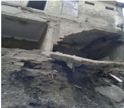
Figure 1: Collapsed buildings.

Bodies searched were placed together at a cremation site at the end of search. Body parts were treated to be as the individual bodies.