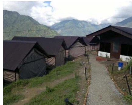
Figure 3: Char dham camp site.