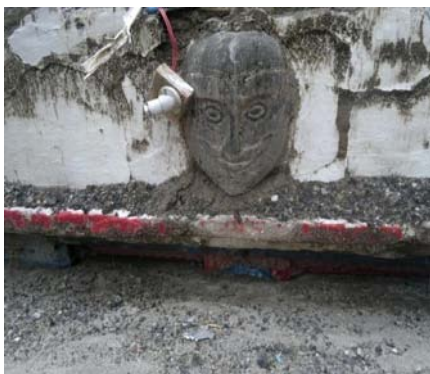
Figure 2: Completely submerged and debris filled the main temple of Gaurikund.