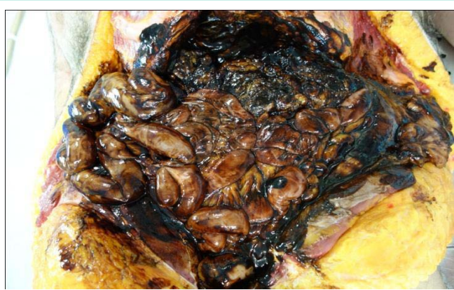
Figure 2: Dark peritoneal fluid coating the bowels.

were fixed with 10% formaldehyde for more than 1 week and embedded in paraffin; the blocks were sectioned to 4-5 micron thickness and analyzed by hematoxylin-eosin stain. Chemical analyses were performed to detect the concentration of sodium and potassium on samples of ascites fluid collected from the abdominal cavity, stored frozen at -20^{\circ}\text{C} until time of testing. After thawing and centrifugation at 1300 \times g for 10 min at room temperature, the supernatant of each sample was analyzed with a V-Lyte Integrated Multisensor ® electrolyte detector on Dimension Vista1500 ® System (Siemens Healthcare Diagnostics, Germany) (Sample Control: Liquid Assayed Multiquel ® Level 1,2, Biorad Laboratories Ltd, USA).