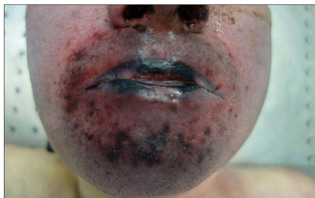
Figure 1: Blackish burn perioral lesions.

A complete autopsy was performed including external, internal, histochemical and toxicological investigations. Histological samples