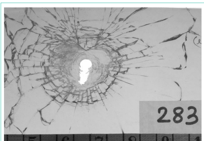
Figure 1: 8 mm bullet entry hole on glass sheet.

No studies were reported on fracture of sun control coated thin film window pane in forensic point of view. In this paper attempts were made to analyse the fracture of glass of sun control coated thin film windowpane as target fired by .315 rifles, 303 rifle, AK47 rifle, 9mm pistol and an improvised pistol using their respective ammunitions and compared their result for collaborative analysis. This study will help forensic examiners ascertain the nature of glass fragmented.