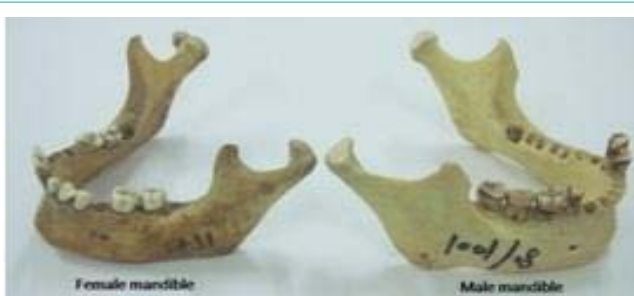
Figure 3: Showing contour of lower border, straight female mandible and undulating male mandible.

human mandibles are mentioned by all forensic anthropologists, but studies on Indian population are scanty. Therefore the aim of this study is to examine the ability and applicability of these variables in North Indian population and to ascertain whether these visual traits are population specific or not.