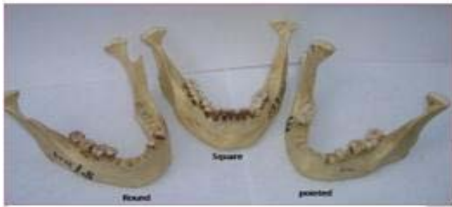
Figure 1: Showing mandibles with round, square and pointed chin.