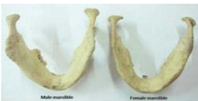
Figure 2: Showing gonial flaring, eversion in male inversion in female mandible.