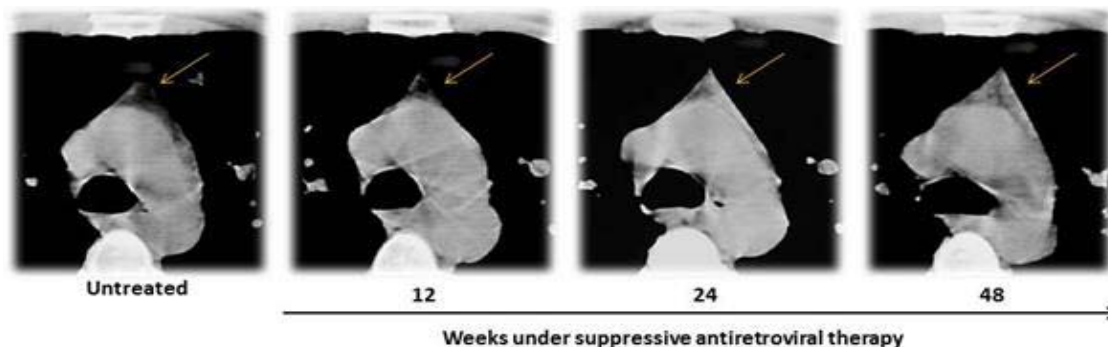
Figure 1: Visualization of thymus slices of a 28-year-old HIV-1 infected patient by Computed Tomography (CT). Enhanced and amplified CT scans at the level of pulmonary artery are shown at baseline and after 12, 24 and 48 weeks under highly active antiretroviral treatment. Thymus outline and density (indicated by yellow arrows at the top centre of each frame) increased progressively after treatment introduction.