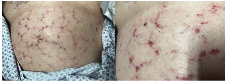
Figure 1: Retiform purpura.