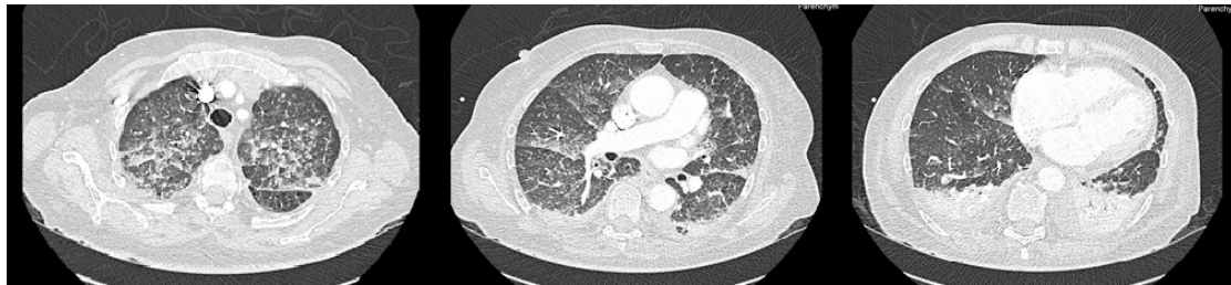
Figure 2: Thoracic CT-scan.