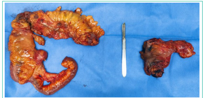
Figure 2: Right colon and rectal specimens.

The surgical time was 195 minutes, and the estimated intraoperative blood loss was 100ml. Patient resumed flatus 36 hours after surgery, and oral liquid diet was resumed on the 3rd day after surgery. The pathological report staging of right colon cancer was AJCC stage II (pT3N0M0), with moderately differentiated adenocarcinoma and negative circumferential margin. No positive lymph nodes were found in the 20 harvested lymph nodes. The pathological report staging of rectal cancer was