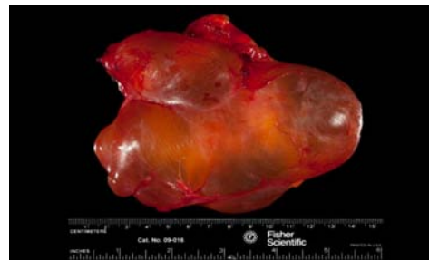
Figure C: Resected pericardial cyst (13.5 x 10.5 x 5.8 cm).