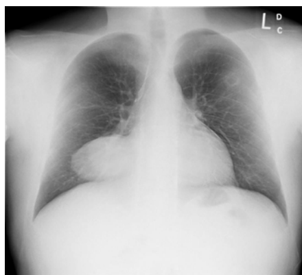
Figure A: Chest radiograph image showing a mass projected over the right lower chest.

Patient is a 52 years old man referred for treatment of chronic lymphocytic leukemia. At time of referral a routine chest radiograph showed a mass projected over the right lower chest. Computerized tomography images were obtained that demonstrated a pericardial cyst measuring 10.9 cm in the largest diameter with some compressive atelectasis of the right middle lobe (Figure A). The patient had no